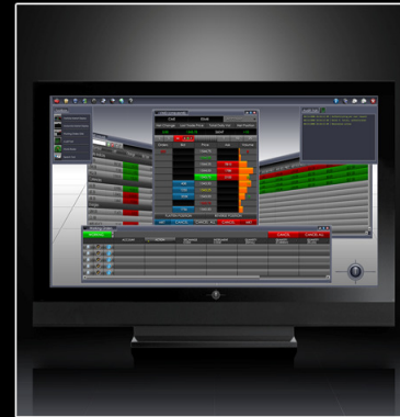
Neostation™ Gen V

Neotick is the true convergence of almost two decades of market wisdom and knowledge.